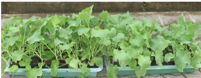
Tolerant variety control