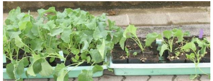
Susceptible variety control