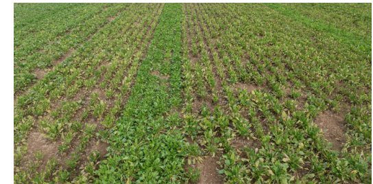
A strip of CHYMA KWS clearly showing it's healthier canopy, sown in a field of a non KWS variety near Woodbridge. Photo taken on 16th October, 2024

To learn more about our sugar beet varieties and seed technology please download our 2025 portfolio, click here .