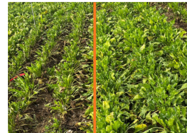
Plots treated with fungicides twice, CHYMA KWS on the right. A significantly greener and more vigorous canopy.