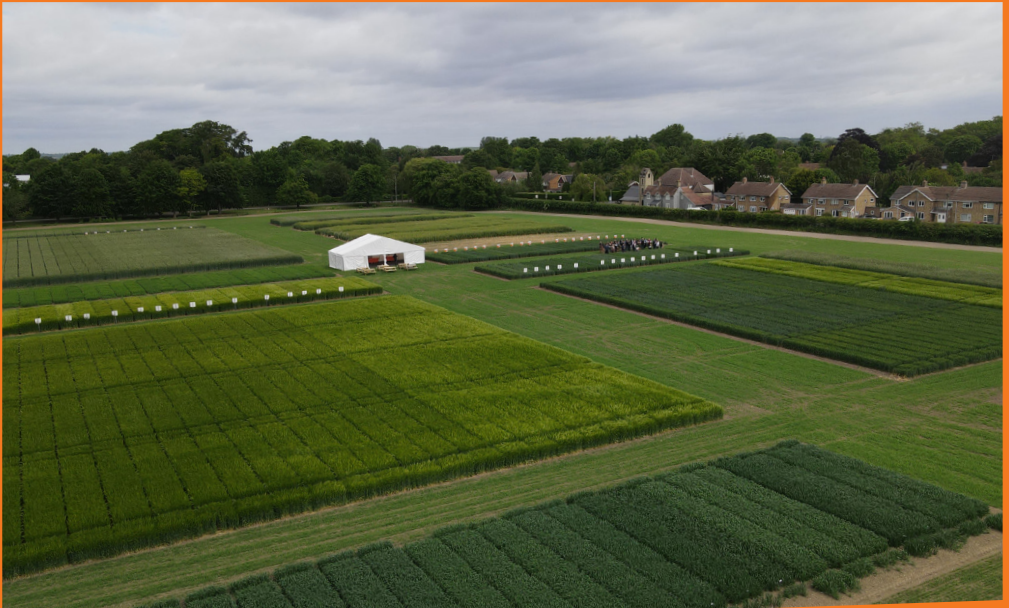
Product Development Field - Fowlmere

This newsletter has been produced to the best knowledge available at the time of printing, no liability can be accepted for any mistakes or loss in relation to this newsletter.