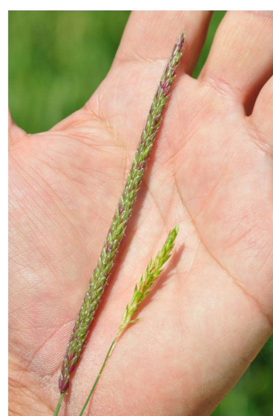
Blackgrass from wheat (left) and rye (right)