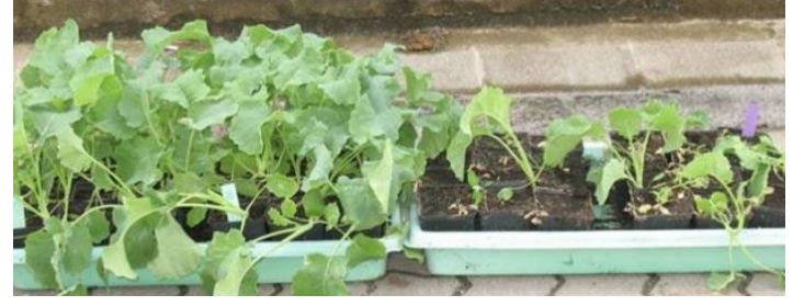
Susceptible variety control Susceptible variety inoculated

A disease that can have severe effects on the gross output of oilseed rape.